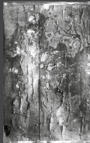
Sv. Martin – stanje prije, tijekom i nakon radova / St. Martin - before, during and after conservation and restoration