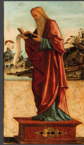
Sv. Šimun – stanje prije, tijekom i nakon radova / St. Simeon - before, during and after conservation and restoration