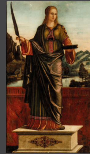
Sv. Stošija – stanje prije, tijekom i nakon radova / St. Anastasia - before, during and after conservation and restoration