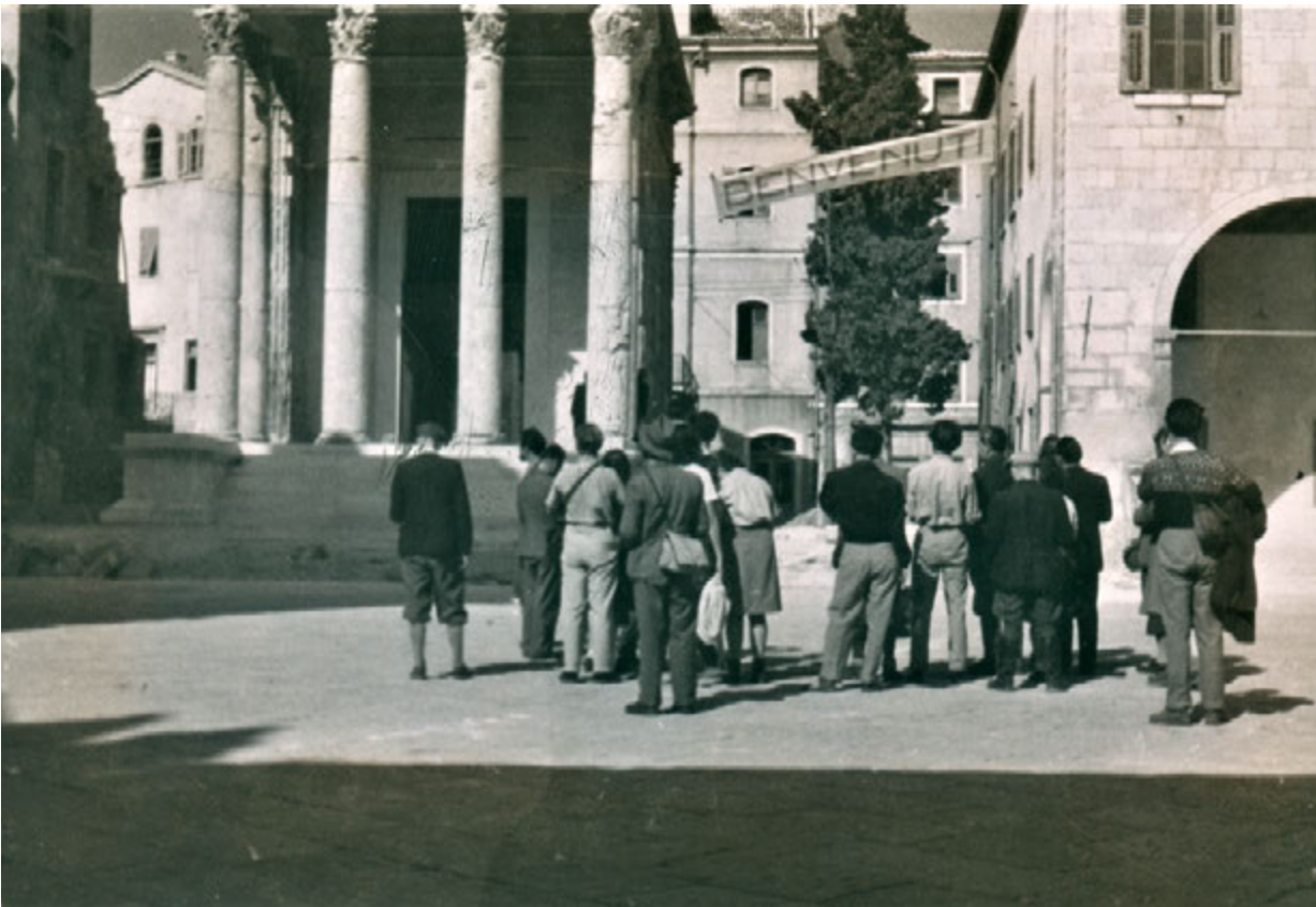
6. Tihomil Stahuljak, Students from Ljubljana in front of the Temple of Augustus in Pula, October 1947 (Ministry of Culture and the Media, Directorate for Conservation of Cultural Heritage, Photo Archive, inv. no. 5105)

Tihomil Stahuljak, Ljubljanski studenti ispred Augustovog hrama u Puli, listopad 1947. (Ministarstvo kulture i medija, Uprava za zaštitu kulturne baštine, Fototeka, inv. broj 5105)