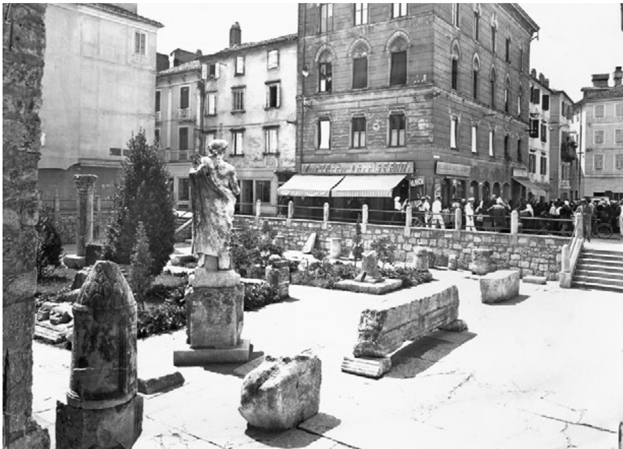
3. Zadar, Square in front of the liberated Saint Donatus, early 1930s (Ancona, Soprintendenza archeologia, belle arti e paesaggio delle Marche (SABAP), Photo Archive)

Zadar, Trg ispred oslobodene crkve sv. Donata, početak 1930-ih (Ancona, Soprintendenza archeologia, belle arti e paesaggio delle Marche (SABAP), Fototeka)