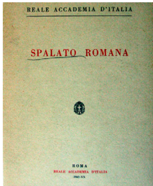
5. Title page of the publication Spalato romana , 1942 Naslovna stranica publikacije Spalato romana , 1942.