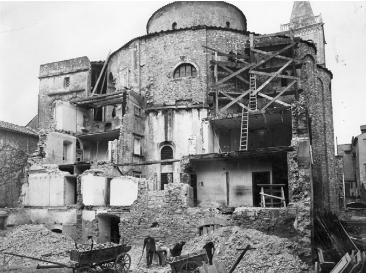
2. Zadar, Saint Donatus during isolation work, around 1930 (Ancona, Soprintendenza archeologia, belle arti e paesaggio delle Marche (SABAP), Photo Archive)

Zadar, crkva sv. Donata tijekom izolacijskih radova, oko 1930-te, (Ancona, Soprintendenza archeologia, belle arti e paesaggio delle Marche (SABAP), Fototeka)