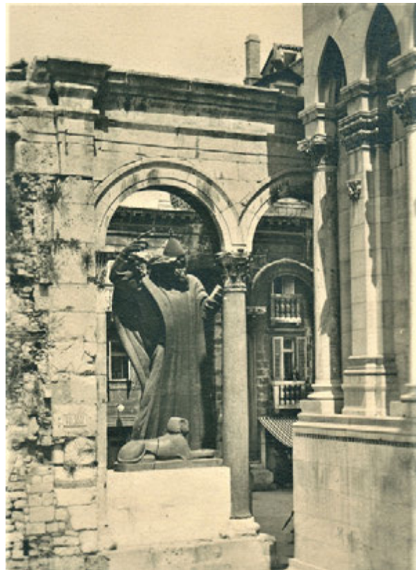
4. Split, Peristyle with Ivan Meštrović's statue of Gregorius of Nin Split, Peristil sa spomenikom Grgura Ninskog Ivana Meštrovića

Even after the arrival of Italian military forces in Dalmatia, journalist and politician Ezio Maria Gray (1885–1969) continued to prove the Roman and Italian nature of Dalmatian arts and customs. 45 This was the reality of the second, martial period, when imperial vocabulary was accompanied with academic puritanism, which meant that, in the field of restoration, acts of removal, substitution and selective reintegration could prevail. Fascist leaders were directly involved in deciding the fates of the monumental settings. This was represented in photos and film-recordings by Istituto Luce, presided over by Gray, showing Mussolini and his entourage in frequent ceremonial visits to archaeological sites and torn-down blocks of Rome. 46 In the 1930s, as Il Duce personally approached Nuova Antologia , his close associate and Governor of Rome, Giuseppe Bottai (1895–1959), explained his visions of urban planning in the historic core of the Capital, tackling the problems opened years earlier by Giovannoni. 47 Mussolini's achievements were also promoted by the director of Deutsches Archäologisches Institut , Ludwig Curtius (1874–1954). 48