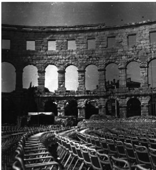
7. Pula, Amphitheatre in 1960 Pula, Amfiteatar, 1960.

selected elements of memory, and became theatres of yet another revolution and social prophecy, marked by triumphalist retaliation and reinvention of the pre-war Yugoslav nationalism.