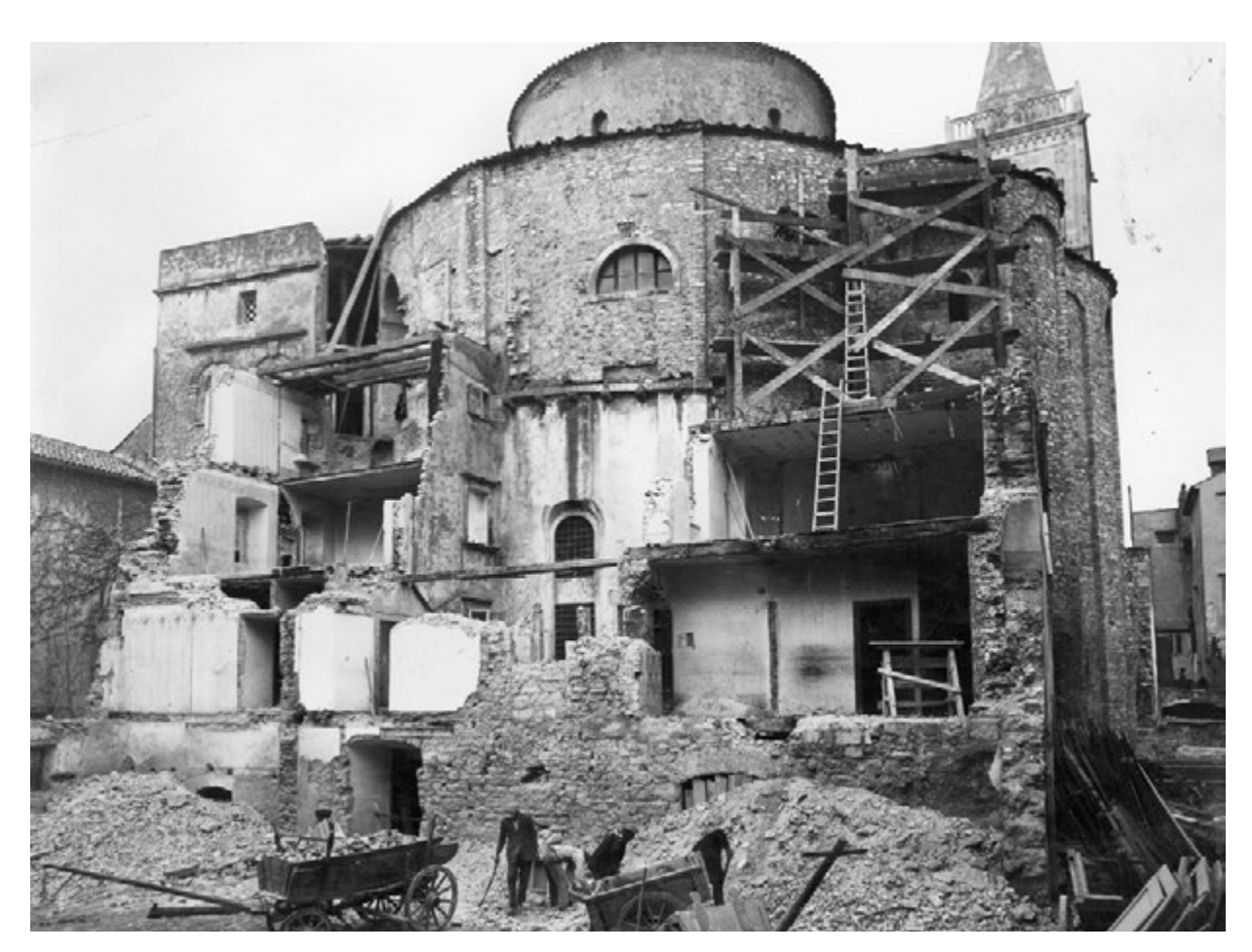
2. Zadar, Saint Donatus during isolation work, around 1930 (Ancona, Soprintendenza archeologia, belle arti e paesaggio delle Marche (SABAP), Photo Archive) Zadar, crkva sv. Donata tijekom izolacijskih radova, oko 1930-te, (Ancona, Soprintendenza archeologia, belle arti e paesaggio delle Marche (SABAP), Fototeka)

developed later, of the Modern cult of monuments as a primarily conservative endeavour, the interventionist, purifying and discriminative approach of the historicist generation was reinstalled after 1918 and put into practice. Smirich had already informed the Italian public on the importance of Saint Donatus in 1901, calling for 'the restitution of the original form' of the church.<sup>27</sup> Writing on restoring the neighbouring church of Saint Chrysogonus in 1920, he disavowed the German and Austrian conservation principle (il principio di non cambiar l'aspetto dei luoghi), 28 advocating the removal of the 'wretched buildings' (miseri edifizi) and 'posterior superfluities' (le posteriori superfetazioni) to be able to create an open space and reintroduce old perspectives.<sup>29</sup> Smirich was, therefore, pursuing redefinition of the whole quarter by subtraction (or isolation) and redesign.