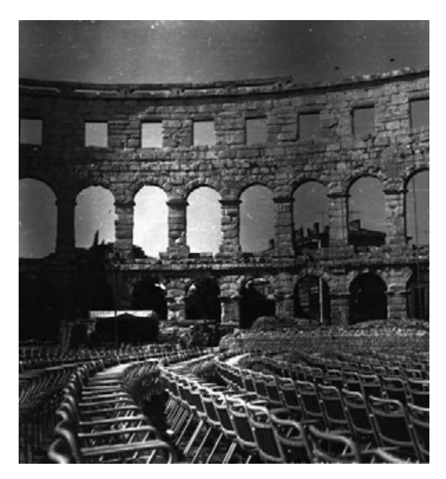
7. Pula, Amphitheatre in 1960 (Ministry of Culture and the Media, Directorate for Conservation of Cultural Heritage, Photo Archive, inv. no. 32780, neg. no. II-7961)

Pula, Amfiteatar, 1960. (Ministarstvo kulture i medija, Uprava za zaštitu kulturne baštine, Fototeka, inv. broj 32780, br. neg. II-7961)