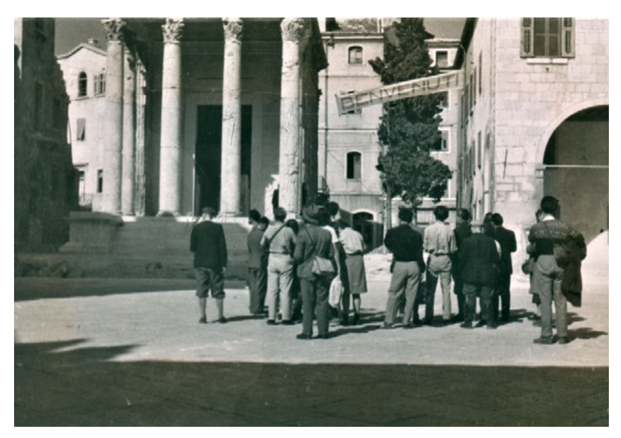
6. Tihomil Stahuljak, Students from Ljubljana in front of the Temple of Augustus in Pula, October 1947 Tihomil Stahuljak, Ljubljanski studenti ispred Augustovog hrama u Puli, listopad 1947.

Yet, along with the political reforms in the newly established Italian Republic, Giovannoni's successors - Roberto Pane, Guglielmo de Angelis D'Ossat, Renato Bonelli and Carlo Ceschi – initiated a revision of the paradigm of the pre-war patriarch's scientific restoration. 58 Renewed debate on reconstruction of the old settings (vecchie città, ambienti) motivated the discussion on interrelations between the isolated entity and a heterogeneous, often bombarded whole; so, amidst political reforms, monuments attained a new social role. 59 Although it was not easy to propose a new paradigm of restoration in a transforming, postfascist society, the scale of destruction of the world-famous artworks in the hearts of Italian cities had to become a public - that is, political - issue. At least if we understand reconstruction as the conservators' tool for healing trauma and affirming the country's democratic future and economic stability.