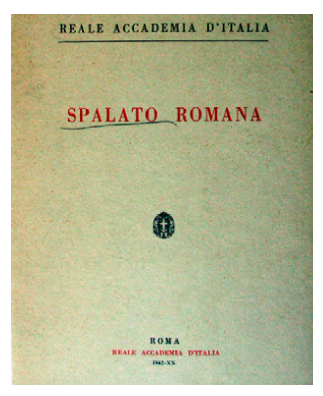
5. Title page of the publication Spalato romana, 1942 Naslovna stranica publikacije Spalato romana, 1942.