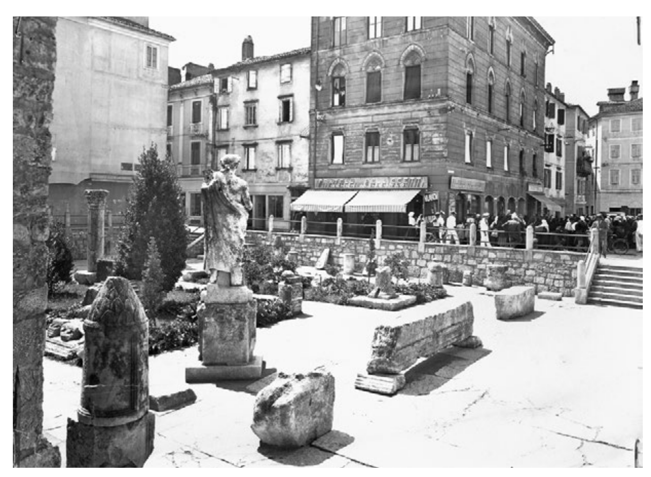
3. Zadar, Square in front of the liberated Saint Donatus, early 1930s

Zadar, Trg ispred oslobođene crkve sv. Donata, početak 1930-ih